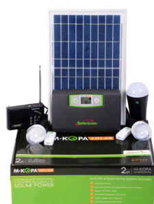
Fig. 03: Solar Home Systems

LEFT: M-KOPA Solar Home System comprise: 2 LED lights with switches and multiple brightness settings; 1 LED portable solar torch light; Phone charging USB with 5 standard connections; Portable solar radio; 8W high quality solar panel.