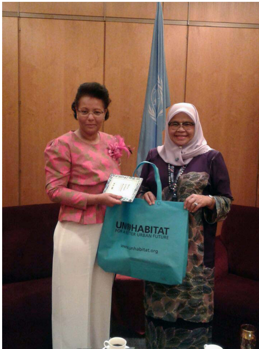
Minister of Land Planning and Housing of Angola with Executive Director of UN-Habitat, WUF 9 (Feb. 2018- Malaysia)