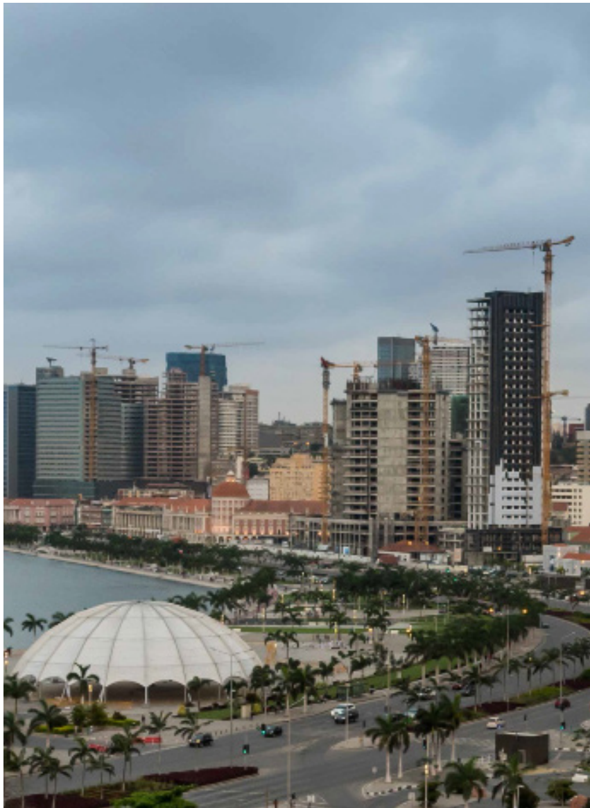
Luanda, Angola