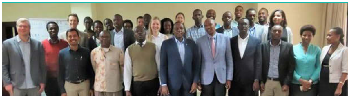
Participants at the Urban-LEDS Rwanda launch