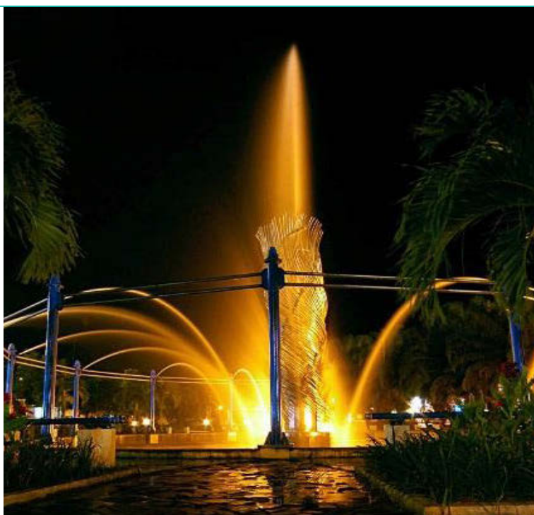
1. Iconic City Symbol of Balikpapan.

From 2013 to 2016, Balikpapan participated in the