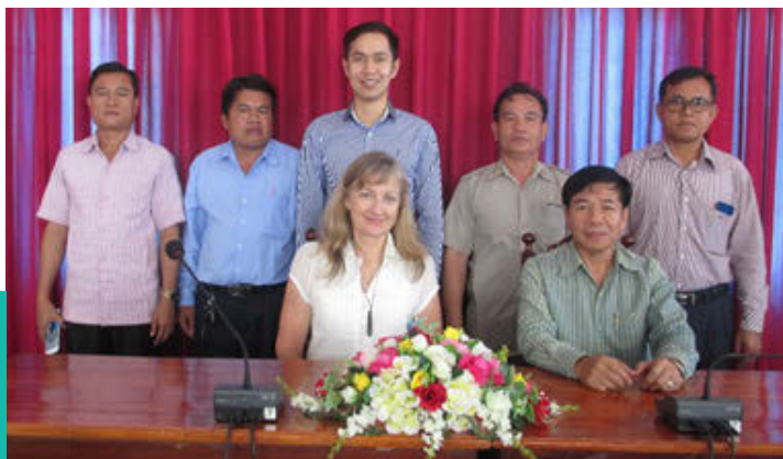
The Urban-LEDS II Project team in Lao meeting with representatives from Kaysone Phomvihane City

Read the full story here: https://bit.ly/2O0MM2S