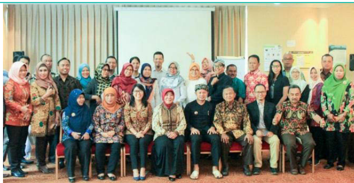
Participants at the Knowledge Management Forum of the Association of Indonesian Municipalities (APEKSI), July 2018

In initial project planning meetings, model cities Bogor and Balikpapan emphasised the need for multi-level governance dialogues on how local governments can contribute to achieving Indonesia's greenhouse gas (GHG) emission reduction target. Read the full story: https://bit.ly/2IKWuJZ