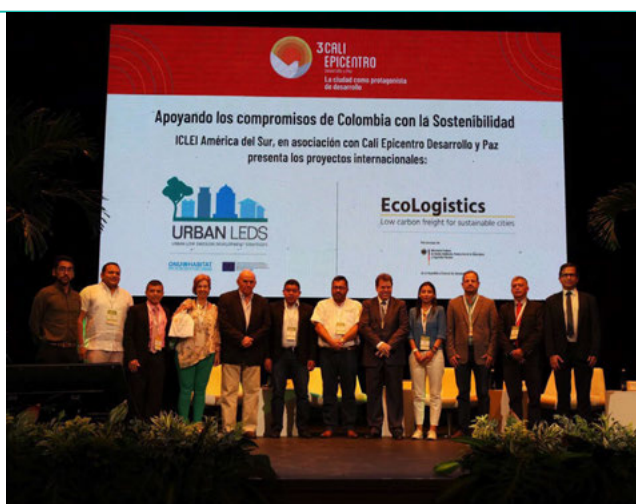
Mayors and representatives of 9 Colombian cities (Metropolitan Area of the Aburrá Valley, Cartago, Envigado, Ibagué, Medellín, Manizales, Santiago de Cali, Tópaga, Valledupar) during the opening of the Cali Epicenter: Peace and Development event.

In February 2018, ICLEI South America opened its first national coordination office in the country. At the occasion, a conference was held on "Sustainable Cities and Low Carbon", which announced the start of the Urban LEDS project in Colombia. In October 2018, the project was officially launched alongside a technical workshop in which the project was presented and participating cities shared their experiences. See photos of the event: https://goo.gl/7vcfKi