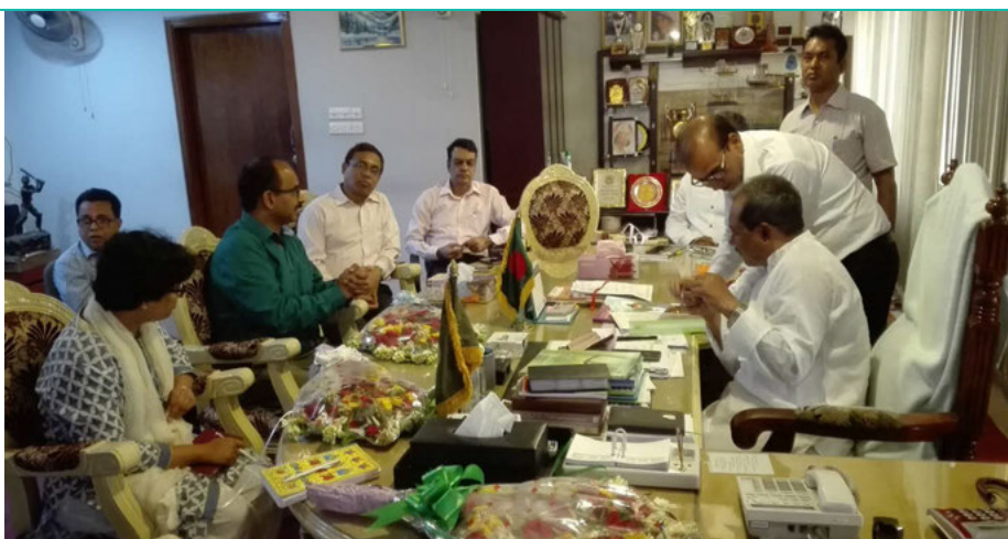
ICLEI South Asia team introducing the Urban-LEDS II project to Honourable Mayor and city officials of Rajshahi city, Bangladesh

Based on the Expression of Interest from cities in Bangladesh, and subsequent discussions, Narayan Ganj and Rajshahi are implementing the project as model cities. Reducing transport emissions, enhancing building energy efficiency and improving solid waste management are some of their stated ambitions. Sirajganj and Singra cities are participating in the project as satellite cities. Read the full story: https://bit.ly/2Z0bNWv