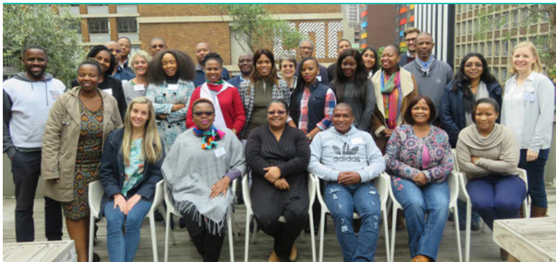
Participants at the Urban-LEDS II Summit: Financing the future we want in the City of Johannesburg, South Africa