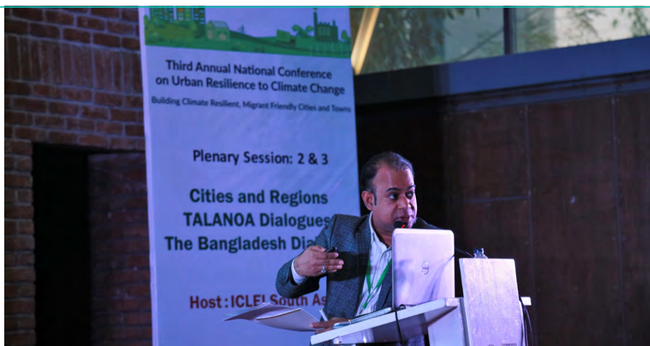
The Bangladesh Talanoa Dialogue in full flow

Stakeholders, including national and local government, attended an exciting dialogue to take stock of climate action and collaboration in Bangladesh. Some of the key lessons identified at the dialogue were building awareness, innovative finance and improving capacity building among all level of stakeholders. Read the Report and the full story here .