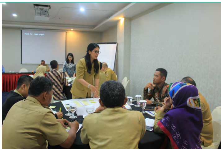
Participants at the City to province dialogue on climate action