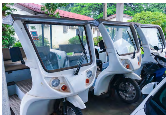
Electric tuk tuk transport in Lao