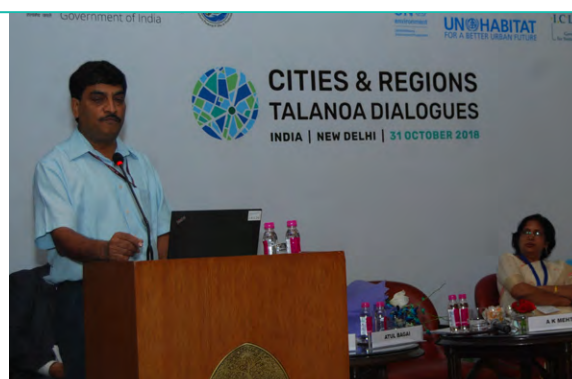
The India Talanoa Dialogue in full flow

Read the report , and the full story here.