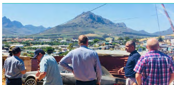
Participants in Saldanha Bay discussing informal settlement electrification