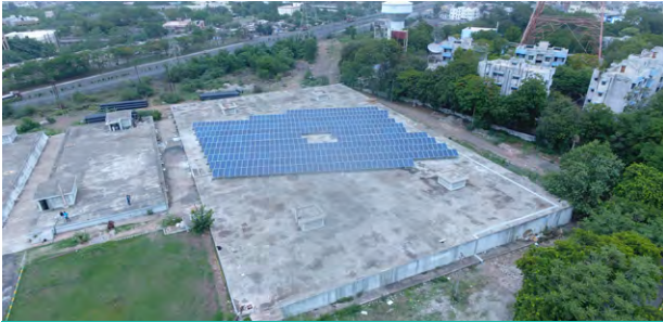
The 145 kW Solar PV system installed at one of Rajkot's water treatment plant, as part of its Urban-LEDS response in phase 1