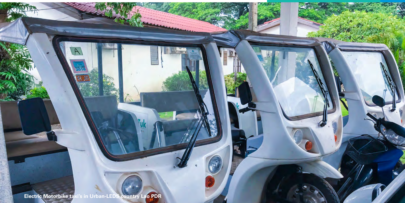
Electric Motorbike taxi's in Urban-LEDS country Lao PDR