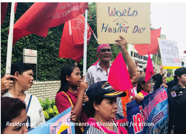
Residents of informal settlements in Thailand call for action

In Brazil, the UN-Habitat office launched a national initiative called the “Urban Circuit” (Circuito Urbano in Portuguese) to call for urban events. Over half of the proposals submitted were selected by UN-Habitat to receive support and events took place in 29 cities.