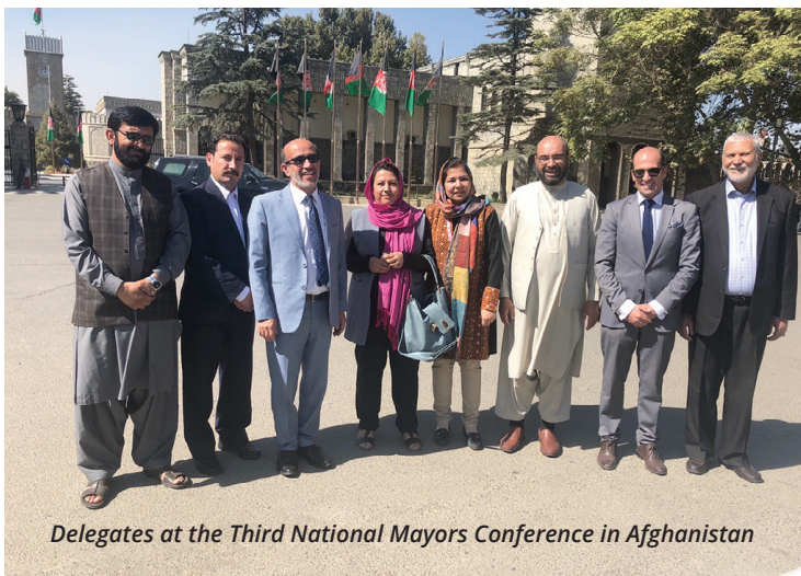
Delegates at the Third National Mayors Conference in Afghanistan

In Asia more than 40 events were held in 15 countries. In Afghanistan, the Third National Mayors’ Conference discussed the country’s rapid urbanization process while in India, UN-Habitat, the Ministry of Housing and Urban Affairs and partners organized activities, including an Urban Café on ‘River and Habitat’, about urban rivers and water bodies in urban areas.