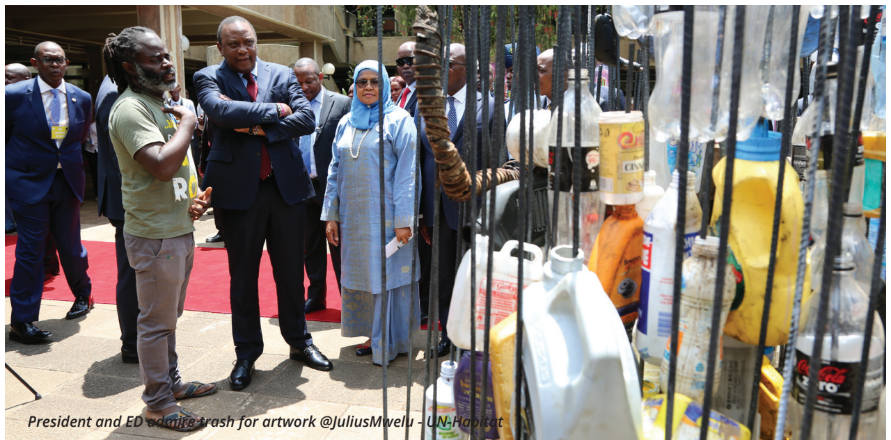
President and ED admire trash for artwork