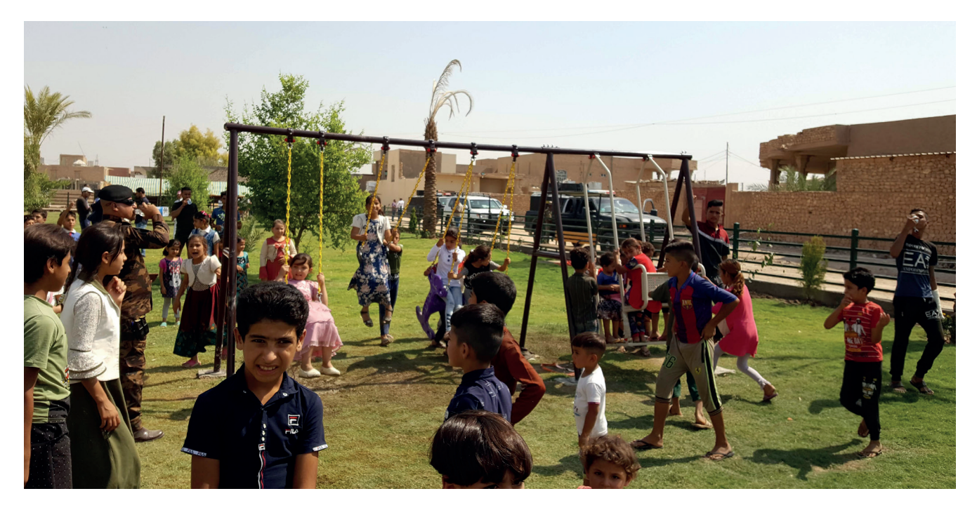
Ramadi kids in Iraq benefiting from public space