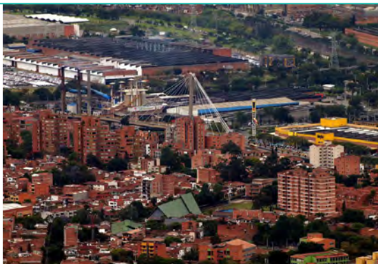
Envigado Antioquia (Colombia) landscape

The LEDS Lab process will soon be launched in two Colombian cities (to be selected in April 2020). The selected city projects will be approved by the newly-appointed local governments and take into consideration the TAP projects submitted to the 2018 TAP pipeline.