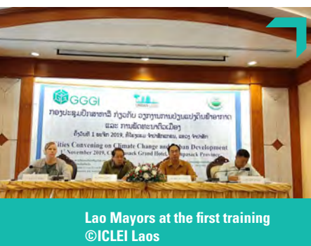
Lao Mayors at the first training