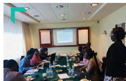
PAG Rwanda

The 3rd Rwanda Urban-LEDS II project national PAG meeting was held on 10 October 2019 in Kigali. The meeting updated the PAG on project implementation progress and alignment with other projects in Rwanda. Read the full story here.