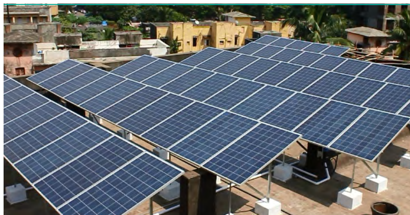
Solar PV System at municipal school in Thane