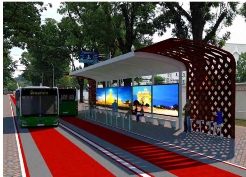
A model image of the Vientiane Sustainable Urban Transport Project by the Ministry of Public Works and Transport (MPWT) of Lao's People Democratic Republic (Lao PDR).

In addition to that activity, the Vientiane Sustainable Urban Transport Project implemented by the Ministry of Public Works and Transport (MPWT) will help improve urban transport operations and capacity in Vientiane by establishing a transport management entity, high-quality bus services, and a bus rapid transit (BRT) system. The project promotes gender mainstreaming, greenhouse gas emissions reduction, and public-private partnerships. The project implementation started in August 2018 and is envisioned to be complete before the end of 2020.