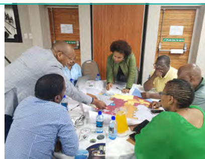
uMhlathuze SDG workshop participants locked in discussion.

Under the Urban-LEDS II objective on multilevel governance, ICLEI Africa organized a successful pilot workshop on 5-6 December 2019 in the City of uMhlathuze to discuss the localisation and institutionalisation of the SDGs. Read the full story here.