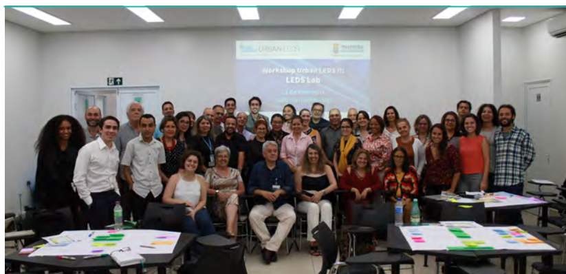
Participants in the first LEDS Lab workshop in Belo Horizonte.