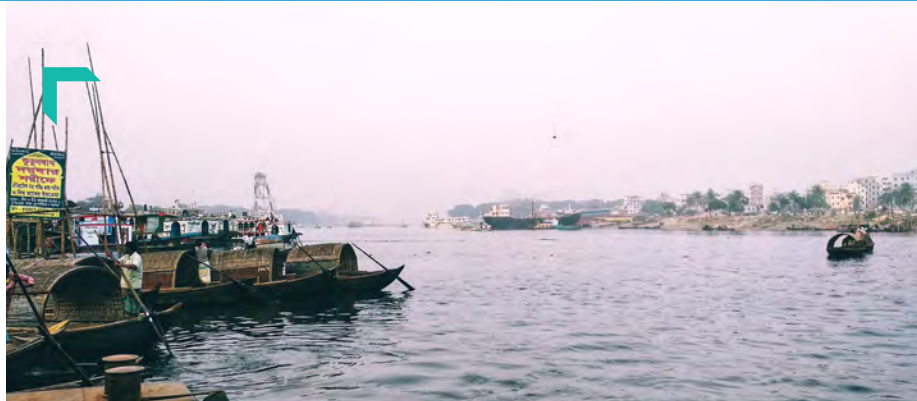
Bangladesh ferries used for commuting across Shitalakhya river in Narayanganj