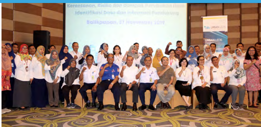
Participants at the climate risk and vulnerability assessment in Balikpapan City