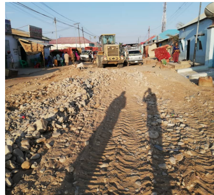
Road surveying in Garawe

In Puntland, the Minister of Public Works, Housing and Transport, Puntland State of Somalia, together with the Mayor of Garowe launched a new phase for the implementation of the Garowe Spatial Strategic Plan in August 2019.