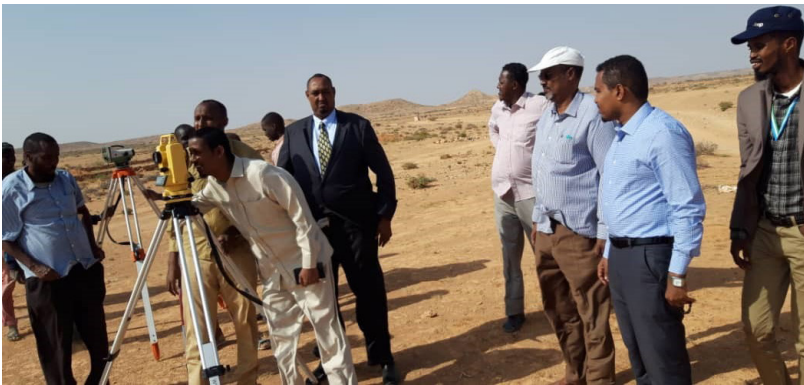
The Minister and the Mayor of Garowe visiting the extension area