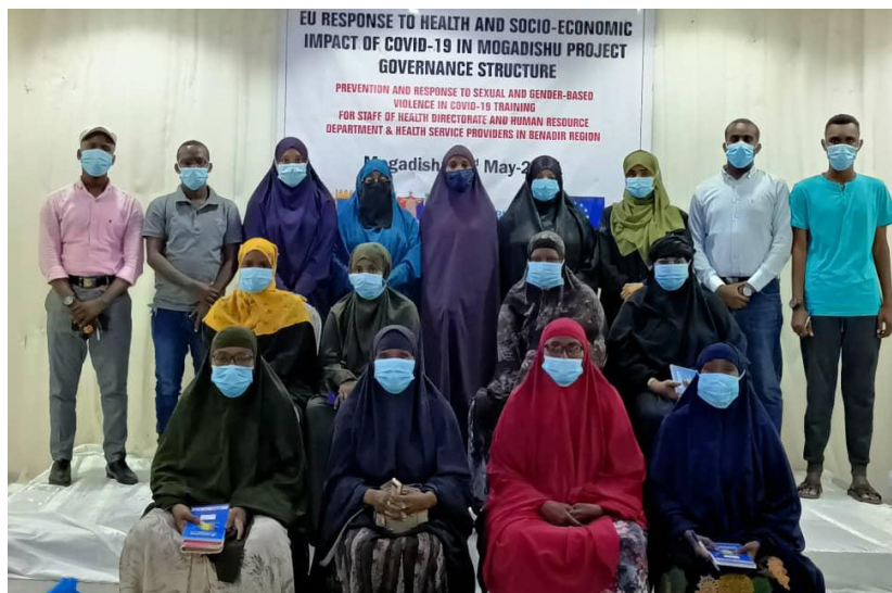
Some of the participants drawn from the BRA Directorate of Health and Human Services, health workers and community surveillance teams from Benadir Region during the training in Mogadishu.