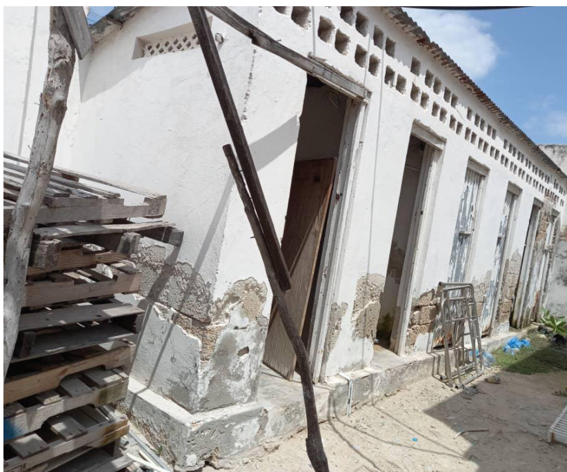
The current state of the facilities of Halane health center in Wajadir district of Mogadishu that is being assessed for renovation purposes.