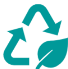
Environmental Management and Climate Resilience