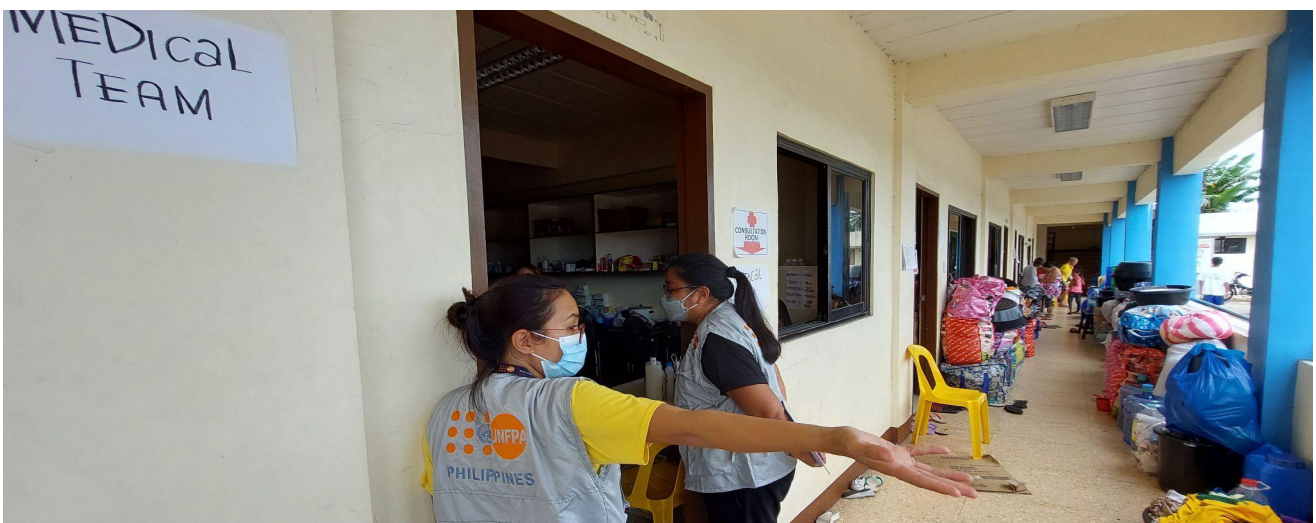
UNFPA field team in Southern Leyte supported a Mental Health and Psychosocial Support (MHPSS) intervention for displaced families affected by Tropical Storm Agaton in April 27, 2022

The Commission on Election (COMELEC) issued a resolution on the prohibition of any public official or employee to release, disburse or expend public funds, effective March 25, 2022 until May 8, 2022. This prevented government agencies from directly disbursing cash, food, and material assistance to survivors of GBV, especially at crisis centers. The GBV Sub-Cluster, working with the Protection Cluster, continued its advocacy for the principles of Centrality of Protection, Do No Harm and Accountability to Affected Populations (AAP).