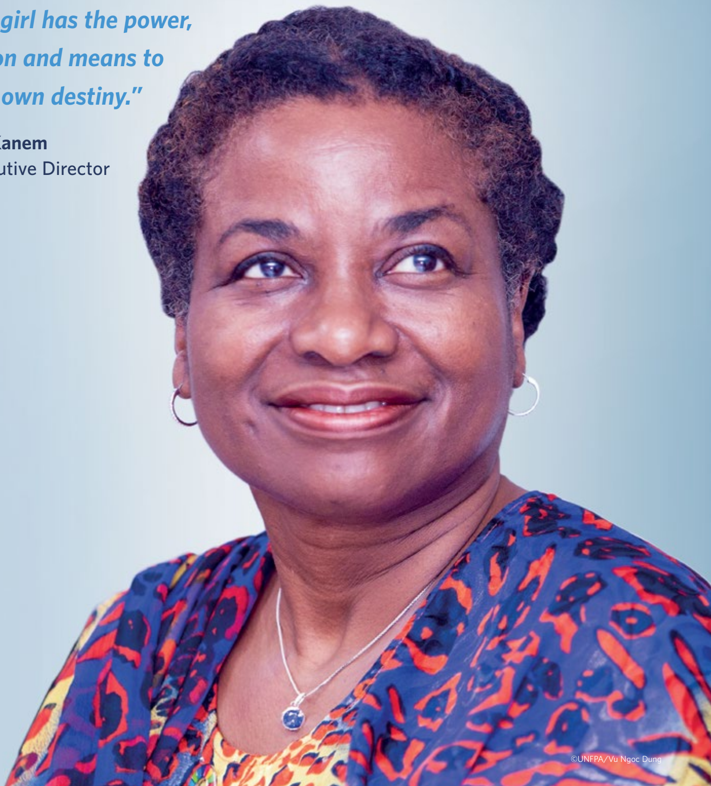
Dr. Natalia Kanem UNFPA Executive Director

"I see a future where every woman and every girl has the power, information and means to shape her own destiny."