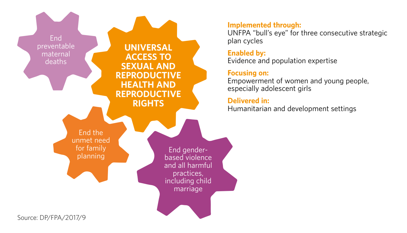
Figure 1. Universal and people-centred transformative results