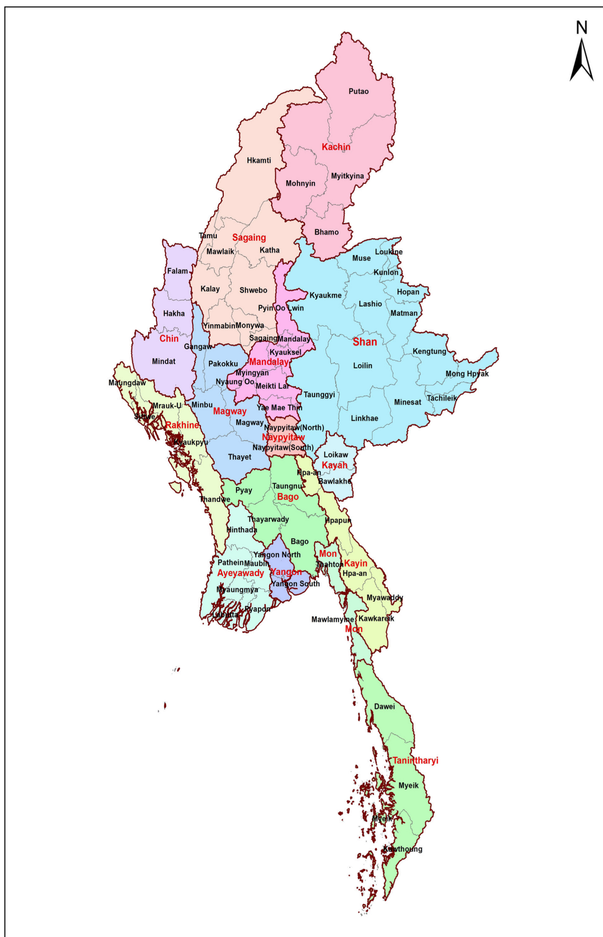
Figure 1: Map of Myanmar by States/Regions and Districts