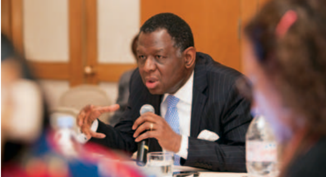
◀ UNFPA Executive Director Babatunde Osotimehin.