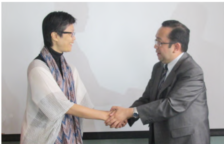
The signing of Memorandum of Understanding for the partnership between Angsamerah Foundation and UNFPA for the development of UNALA

In the absence of supporting policies that enable the government to provide SRH services for youth, UNFPA has come up with an innovative scheme to engage the private sector in delivery of services through a social franchising approach. In 2014, UNFPA has established a partnership with Yayasan Anak Bangsa Merajut Harapan (Angsamerah Foundation) for the implementation of UNALA (meaning 'your ability to make decisions'), a private sector-led SRH services model designed specifically for youth. The model will be piloted in Yogyakarta, a province in Indonesia, which has a large proportion of youth, with many universities and a mix of rural and urban youth (15 to 24 years old).