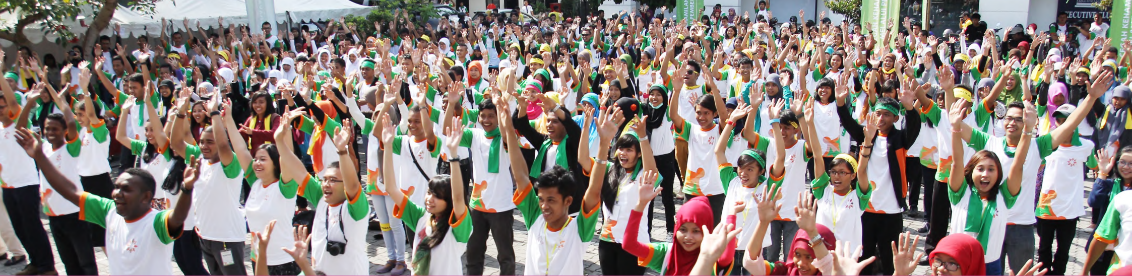
Hundreds of young people doing a flash mob in Youth Jamboree in Yogyakarta, 10 November 2013

The second step will be to establish a network of youth organizations and youth-related NGOs that will provide a means for the franchise to provide youth with a broader range of information and activities, including accurate SRH information, and refer them for services as needed. The youth network will be complemented with demand creation activities such as a website, media campaign and peer outreach. UNALA is developed to offer youth with high-quality health