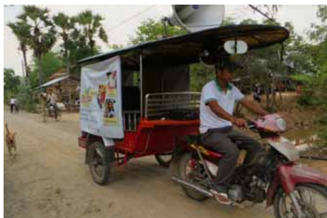
A remork-moto drives through a village broadcasting family planning messages.