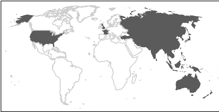
The shaded areas of the map represent ESCAP members and associate members.

ESCAP is the regional development arm of the United Nations and serves as the main economic and social development centre for the United Nations in Asia and the Pacific. Its mandate is to foster cooperation between its 53 members and 9 associate members. ESCAP provides the strategic link between global and country-level programmes and issues. It supports Governments of the region in consolidating regional positions and advocates regional approaches to meeting the region's unique socio-economic challenges in a globalizing world. The ESCAP office is located in Bangkok, Thailand. Please visit our website at www.unescap.org for further information.