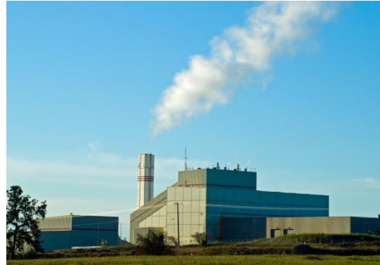
WHTP- STEEL & GLASS