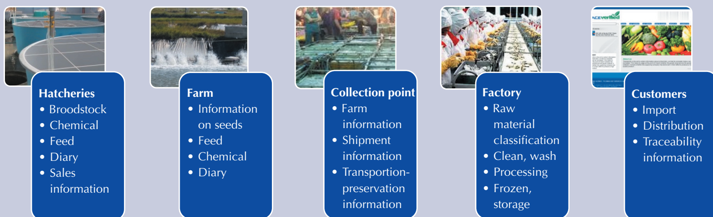
Figure 1: TraceVerified Services

TraceVerified is about verified traceability information. The system, built according to international standards, is highly compatible with target supply chains and is simple in use for any stakeholder, from producers to processors, buyers and consumers.