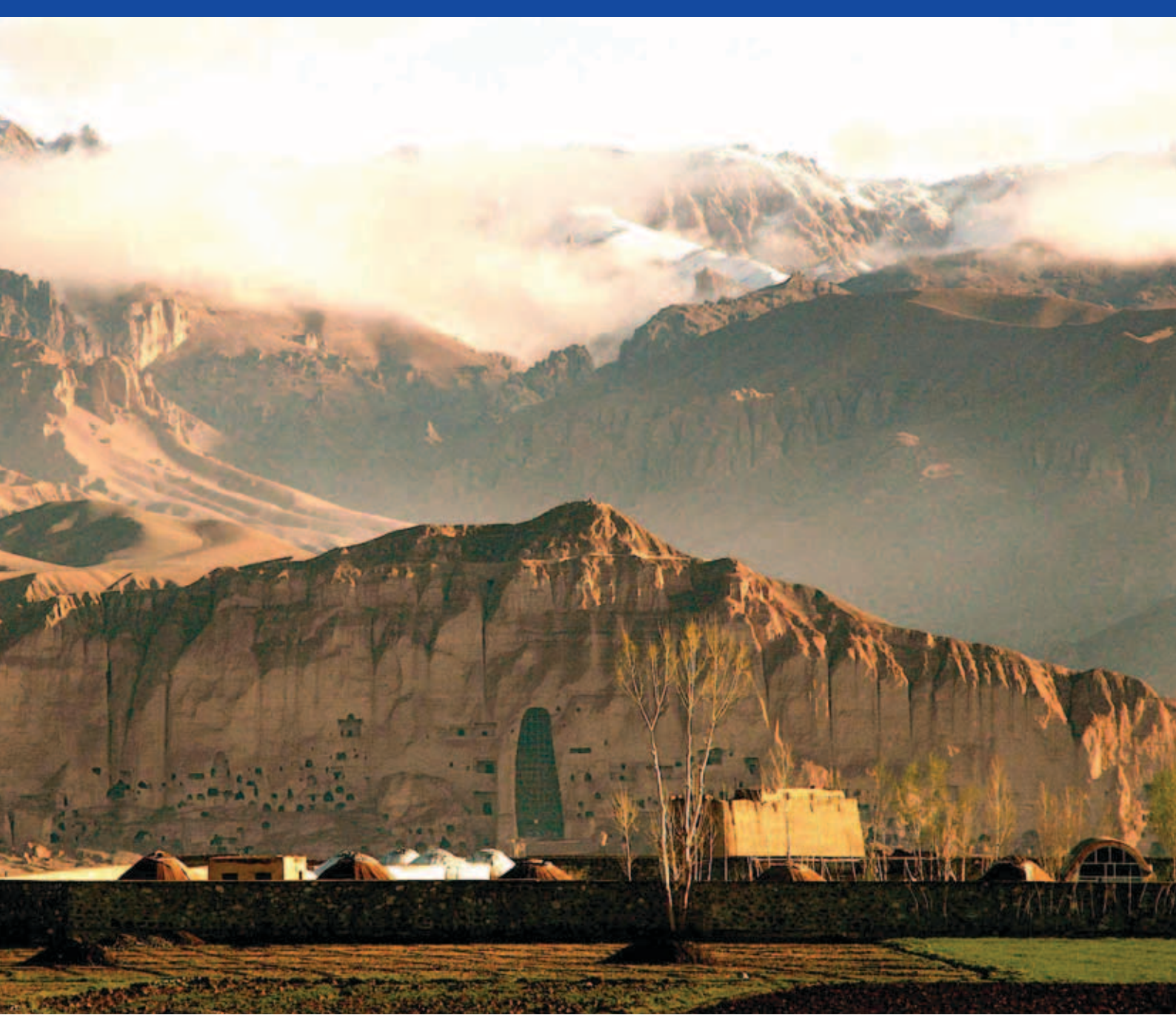
UNESCO World Heritage Site, the Buddhas of Bamyan