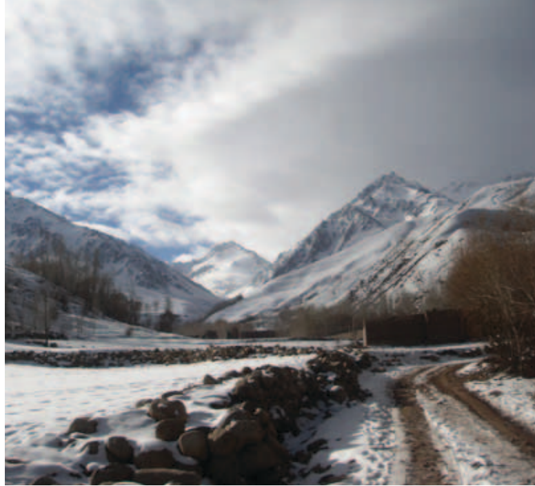
UNEP strives to balance Afghanistan's ecological needs with its human needs.

Given that Afghanistan is one of the poorest and least developed countries in the world, UNEP prioritizes poverty reduction, livelihood generation and protection of human health in the implementation of its environmental activities. UNEP strives to balance Afghanistan's ecological needs with its human needs.