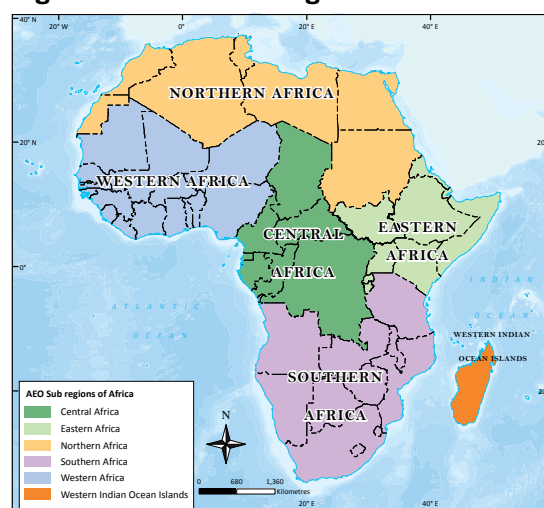
Figure 1: Africa sub-regions

Consistent with the AEO tradition, consultations were made with collaborating centres (CCs) that worked closely with stakeholders in the six sub-regions of Africa (Figure 1) to ensure that relevant priorities and concerns were captured during the AEO-3 assessment and reporting processes. Besides providing relevant data, information and resource