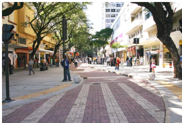
Low speed street in downtown Belo Horizonte.

Creating an environment compatible with low speeds includes using devices such as speed bumps, narrowing roads and widening sidewalks, pedestrian refuge islands, raised pedestrian crossings, roundabouts, shared spaces, chicanes and other road design measures to encourage drivers to slow down and increase safety, particularly for pedestrians and bicyclists. These traffic calming measures, when implemented together in a delimited area, consolidate a low speed zone. Initially, low-cost materials can be used for the application of temporary measures and, as they result in positive impacts, materials of longer duration and better quality are used to build permanent infrastructure.