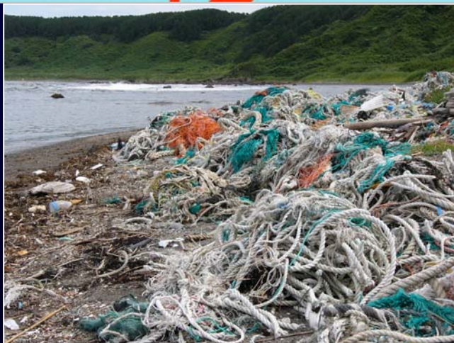
Fishing nets and ropes