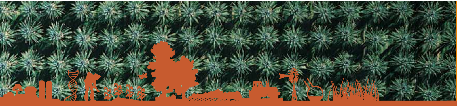
UNEP-GEF PROJECT FOR BUILDING CAPACITY FOR EFFECTIVE PARTICIPATION IN THE BIOSAFETY CLEARING-HOUSE OF THE CARTAGENA PROTOCOL