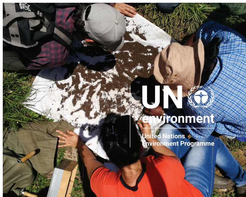
Sampling soil quality