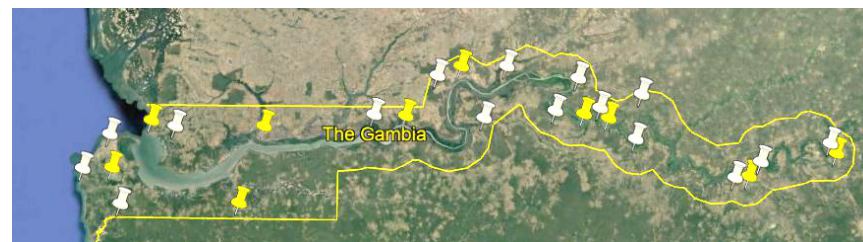
The projects are mostly implemented at the synoptic meteorological stations (yellow) and the hydrological stations (white) in the Gambia.