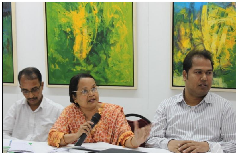
An official of Bangladesh Standard & Testing Institute (BSTI) actively attended the Open Discussion session