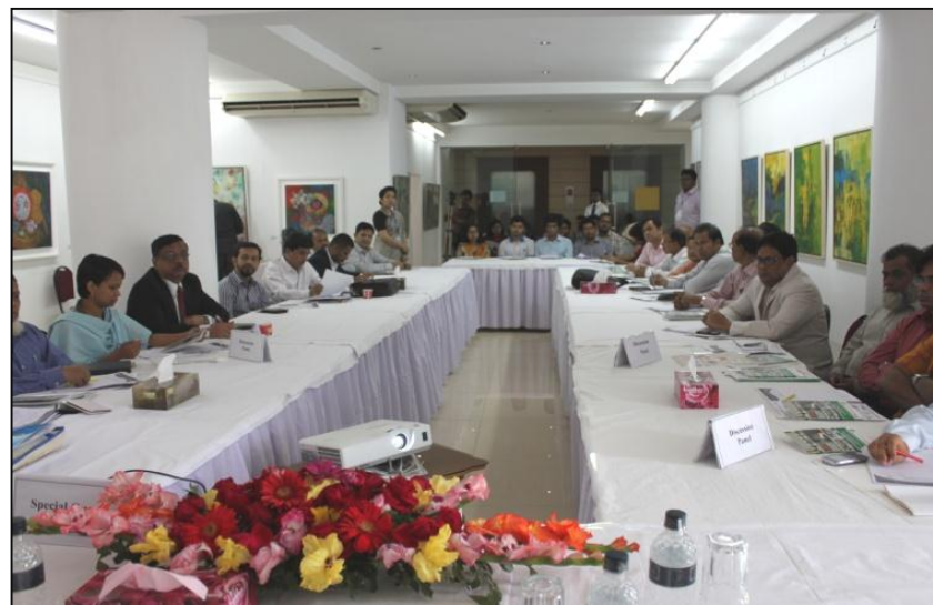
The audiences of the Inception Workshop were from universities, national and multi-national companies, government organizations like BSTI, BCSIR, and Department of Environment