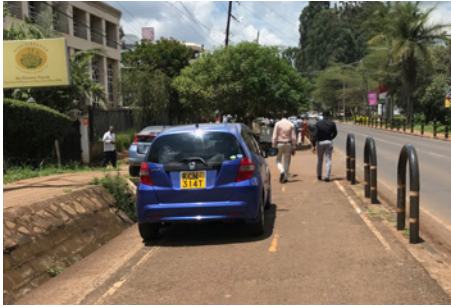
Parking encroachments on NMT spaces