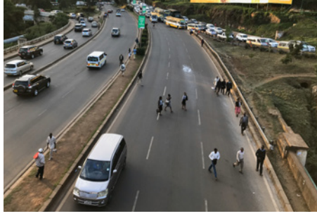
Major corridors designed as highways rather than urban streets