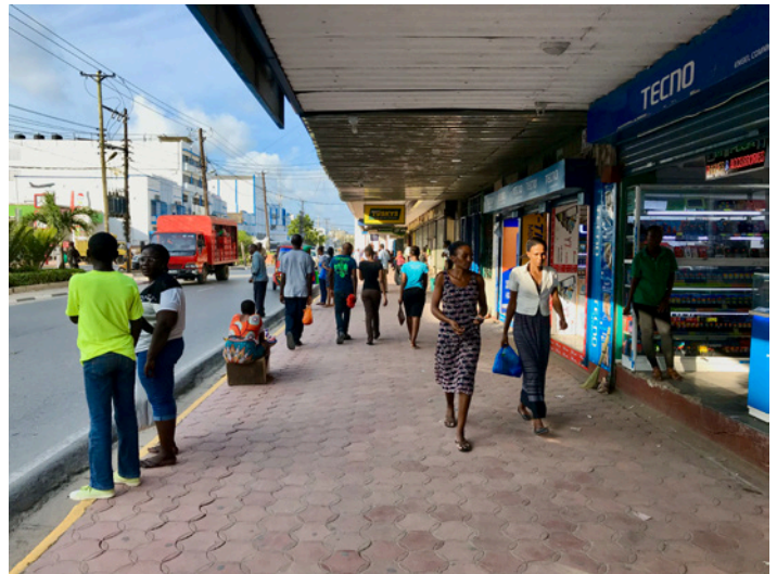
A refurbished walkway in Mombasa

Several counties are taking a leadership role in the provision of NMT facilities. Kisumu, Kenya's third largest city, is developing 1.4 km of high-quality walkways and protected cycle lanes with