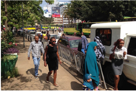
Pedestrian movement blocked by fences