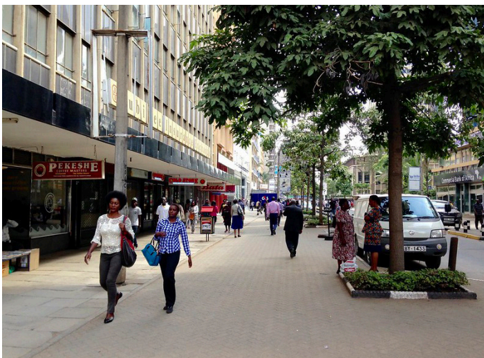
An early NMT improvement project in Nairobi: Footpath widening along Mama Ngina St