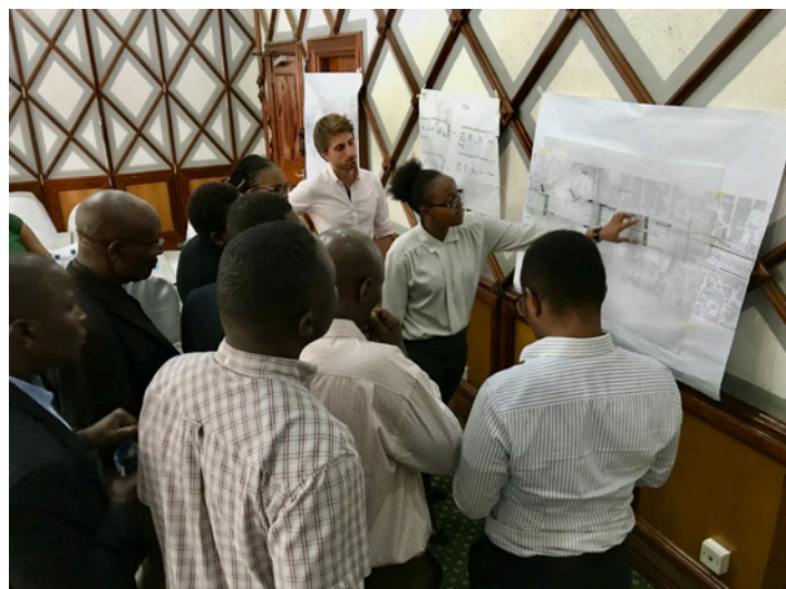
A street design workshop organised by NAMATA