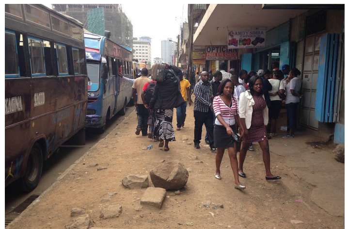
Many streets in Nairobi lack pedestrian walkways

The Kenya National Highways Authority (KenHA) and Kenya Urban Roads Authority (KURA) continue to invest in billions of shillings in the construction of bypasses, missing links, and flyovers in Nairobi and other urban areas. These projects often come at the expense of NMT users, as the new roads are hard to cross and lack accessible walkways. In many cases,