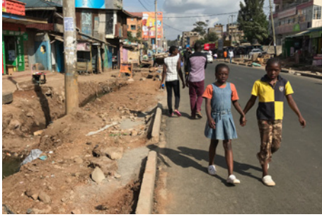
Lack of footpaths on many streets