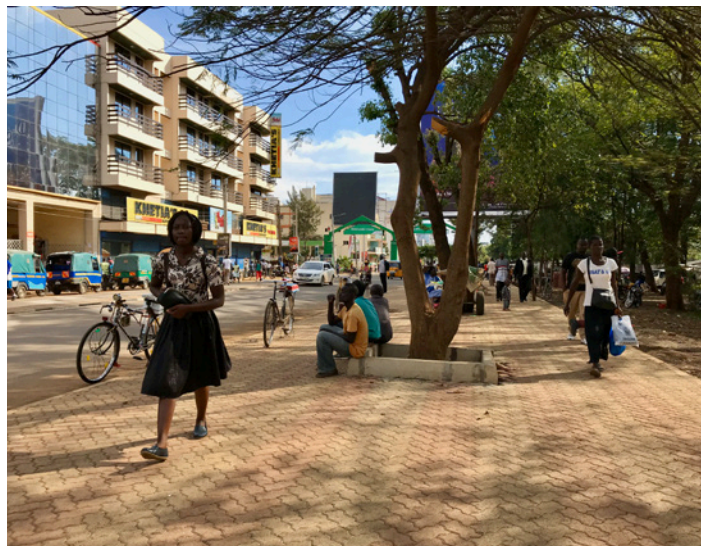
New footpath in Kisumu