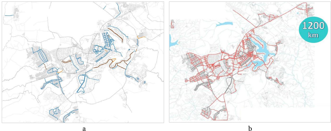
Figure 1: Current (a) and planned (b) dedicated infrastructure for cyclists.