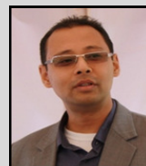
Mahesh Pradhan Chief, Environmental Education and Training Unit, UNEP/DEPI