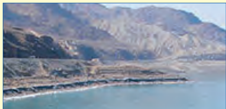
INC7 meeting held from 10 - 15 March, 2016 at the Dead Sea, Jordan

The seventh session of the intergovernmental negotiating committee (INC7) was held from 10 to 15 March, 2016 at the Dead Sea, Jordan. More than 450 participants made substantial progress on a number of issues. The committee adopted, on a provisional basis pending formal adoption at the first meeting of the Conference of the Parties (COP), guidance on import and export of mercury, on identification of stocks and sources of supply of mercury and mercury compounds, and on emissions.