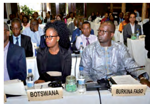
Delegates from Botswana and Burkina Faso participating in the UNEP OzonAction Joint meeting