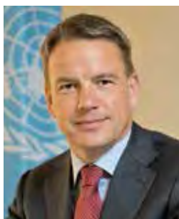
Christian Friis Bach

Under-Secretary-General of the United Nations UNECE Executive Secretary