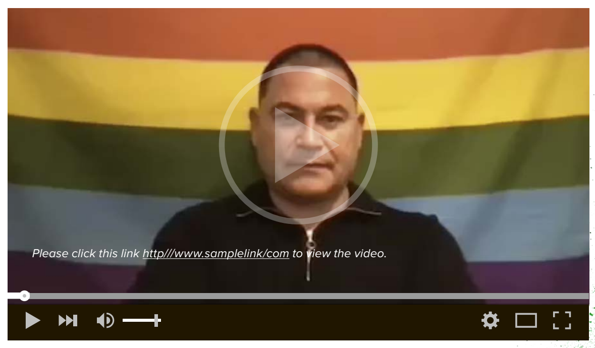
Source: Charles Chauvel, Global Lead Inclusive Processes and Institutions, UNDP; address to Interparlia mentary Plenary Assembly, Copenhagen 2021 Human Rights Forum, August 2021

Finally, never forget the unique authority that your position as a parliamentarian confers on you to promote inclusion and respect for the human rights and dignity of LGBTI people. And never forget that help is always at hand for you to help ensure that LGBTI rights are recognized and honoured around the world for what they are: human rights.